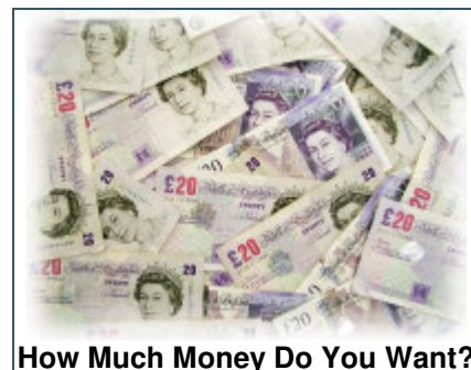
How Much Money Do You Want?

Now You Can Discover The Secret Formula That Can Generate Unimaginable Wealth